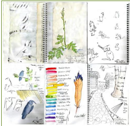
Sketches from Heather's 2009 Holden Workshops

(Mail to: Holden Village, HCO Box 2, Chelan, WA 98816)