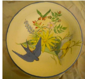
Bird Migration bowl HAW Murphy – side view and top view after final glazing and firing – and before glazing when painting is done.

March 24-25, 2010 – Artists' Bowl Auction on KOHO