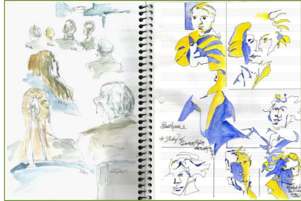
Musical Sketches at ICMC - by HAW Murphy.

Contact: Icicle Creek Music Center (509) 548-6347 or http://www.icicle.org/