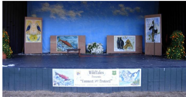
WildTales Banners donated for 2009 Salmon Fest Stage