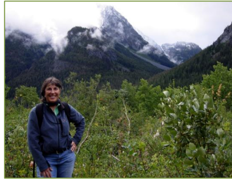
Glacier Peak Wilderness near Holden Village