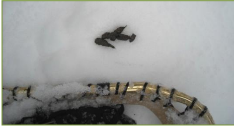
Snowshoe and Marten Scat on White River Feb. '10